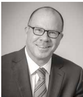
BY JEFFREY R. PICKERING

IMMIGRANTS ARE WILLING TO FACE GREAT ADVERSITY IN SEEKING A BETTER LIFE