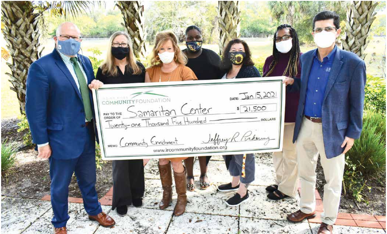
The Community Foundation presents a donation to the Samaritan Center, which offers transitional housing and life-skills development to homeless families in Indian River County.