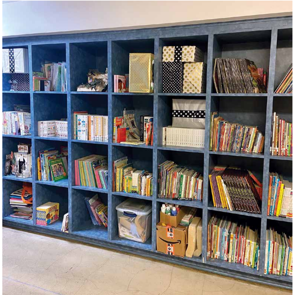
Shelves filled with books for all ages are available for students at the Literacy Services office to help them gain skills in reading, writing, and speaking English.

In Indian River County, there are approximately 3,000 lawful permanent residents (aka “green-card holders”) who are foreign born and authorized to live in the United States. Almost all of these members of the community fall into what the United Way of Indian River County calls the ALICE population, which stands for “asset limited income constrained employed.” Beyond processing times for naturalization applications, which can take more than one year,